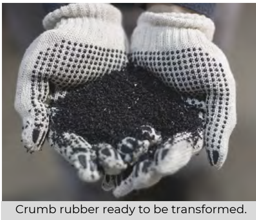
Crumb rubber ready to be transformed.